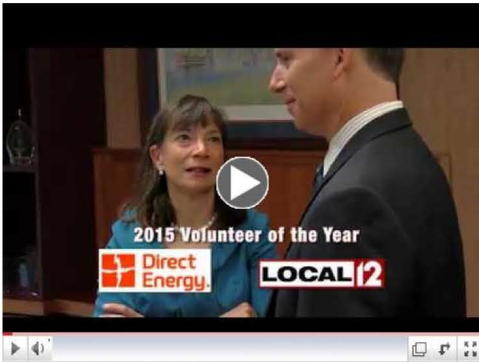
2015 Volunteer of the Year