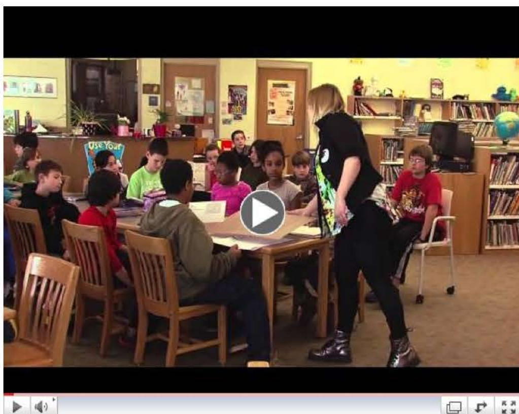
PIE in 30 Seconds

Want a quick overview of what we do? Check out our new 30 second video above! Perfect for an introduction to our case-based program teaching STEM skills to middle school students, you'll want to learn more about PIE.